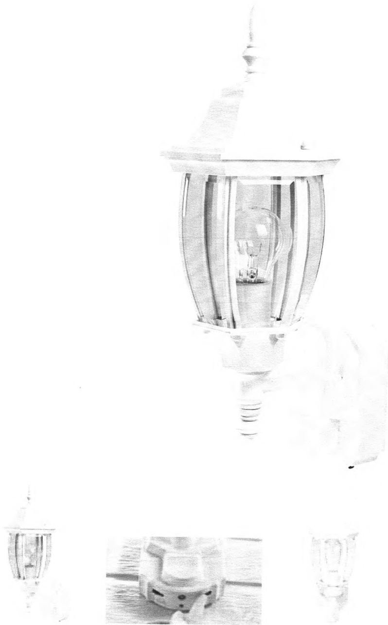
Example: Hampton Bay Alexandria 180 Degree White Motion-Sensing Outdoor Decorative Lamp